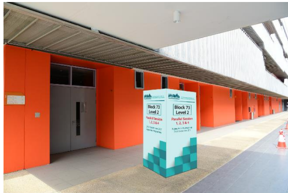
Block 73 Level 2